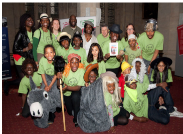
The WAPPY Project: Guildhall, The London Maze 2011

Writing, Acting and Publishing Project for Youngsters (WAPPY), had their poems, prose and artwork published in, The Soul of a Child , launched at the Huntley Conference 2011, funding was donated by The London Metropolitan Archives. WAPPY participated in The Grenadian Sunshine Foundation, The London Maze, Guildhall, Keats House Festival, Acton Carnival and is a partner in the National Lottery heritage funded project led by the Black History and Culture, West London group. WAPPY offers a July/August 'After School' provision. For more information please email: quansah@hotmail.com or visit the website: www.wappy.org.uk .